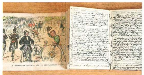
A Punch pocket diary, dated 1879.

England eating Thanksgiving dinner alone, and a Belgian schoolgirl on a trip to Paris in 1906 who sees the headlines announcing the earthquake in San Francisco.